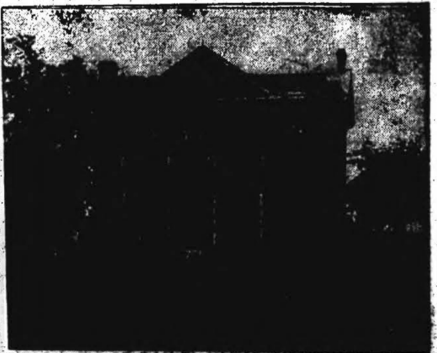
Y. M. C. A. BUILDING

Quick silver sells at the rate of about $50 a flask.