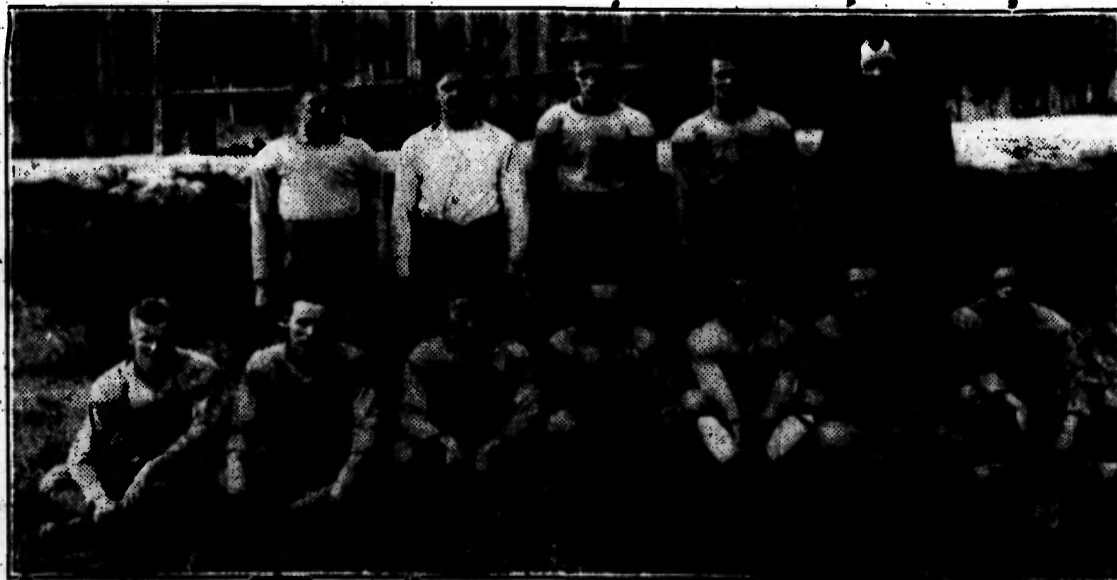
This is the Frogs' grid aggregation for the season just past. Each member of the crew states that it is his intention to make a berth on the first string eleven next year—which means that a lot of stepping about must be done by those who intend being among those present in the strenuous clashes being billed for the season of 1924. Anyhow, they gave the varsity plenty of opposition this fall.