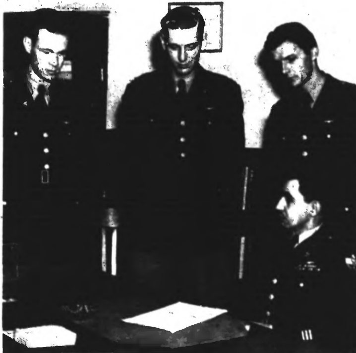
New ROTC top ranking officers are preparing to take over the command of the unit. The appointment of these officers were announced at the military ball.

In case of rain the service will be held in the chapel.