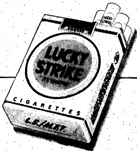
COPIED FROM THE AMERICAN TOBACCO COMPANY

Enjoy truly fine tobacco! Enjoy perfect mildness and rich taste!