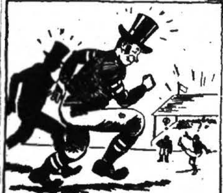
WAY BACK WHEN WISCONSIN FIRST PLAYED MINNESOTA IN FOOTBALL, THE WISCONSIN TEAM TROTTED OUT ON THE FIELD WEARING TOP HATS. THE STUNT SO INFLATED THE COFFERS THAT THEY CRUSHED THE BADGERS 63-0!