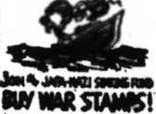
BUY WAR STAMPS!

Patronize CLUSTER Advertisers! (We know this is sideways, but you read it, didn't you?)