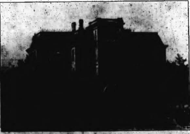
CHAPEL BUILDING The present enrollment is so large that when every student is present many will have to stand in aisle.