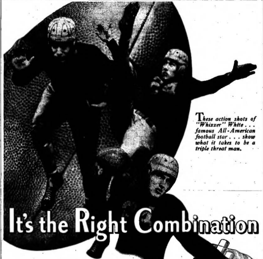
These action shots of "Whizzer" White... famous All-American football star... show what it takes to be a triple threat man.

-Things are so new at The Union that some of them don't even have names yet-