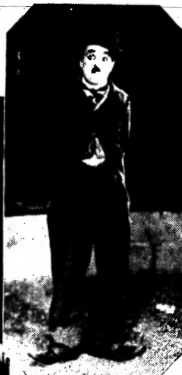
CHARLIE CHAPLIN ... movie favorite the world over, in one of his best-loved pictures —"The Circus."