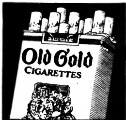
Made from the heart-leaves of the tobacco plant