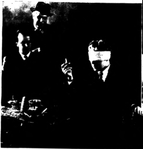
MR. CHAPLIN was asked to smoke each of the four leading brands, clearing his taste with coffee between smokes. Only one question was asked: "Which one do you like the best?"