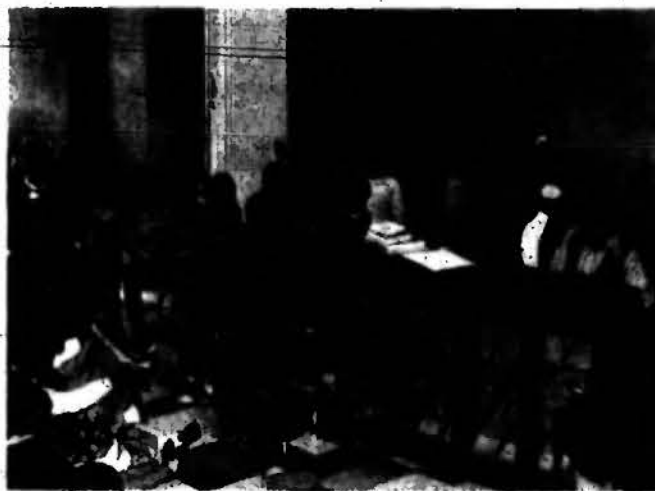
A soul concert livens up the student center as the Community Center sponsors a program of varied entertainment.