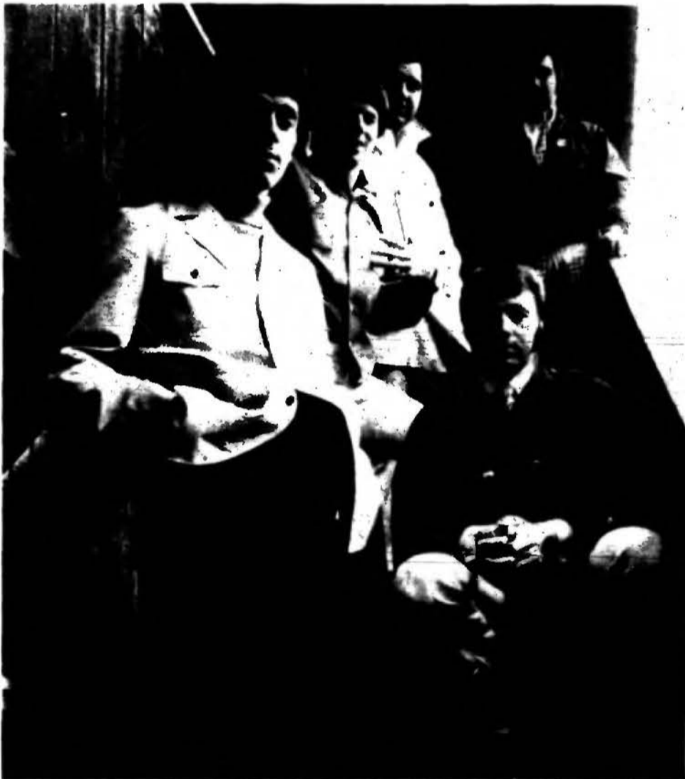
Preview Fall Attraction—Spiral Starecase, one of America's most popular groups, will appear in Willingham Chapel this fall. Currently, the group has two smash hits on the record circuit — "I Love You More Today Than Yesterday" and "No One For Me To Turn To".

All ticket sales will be handled by the College Store, Connell Student Center, Mercer University Campus. It is open Monday through Friday from 9 a.m. to 4:30 p.m.