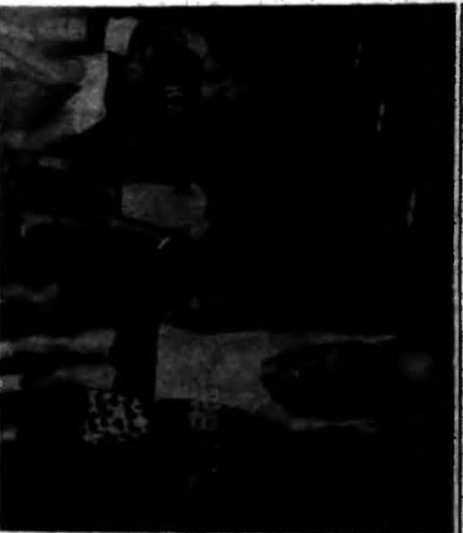
Profs Proficient at Proving Point (a).